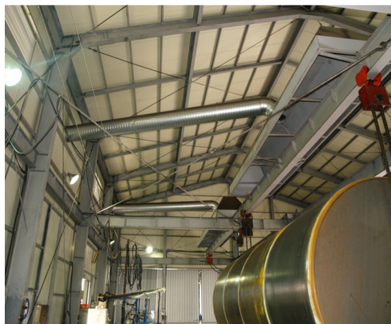
Figure 1. Photograph of local exhaustive ventilation in the lamination workplace

There were a total of 5 workers including one sprayer who conducted coating by spraying the mixture of FRP, UPR, hardner and toner, three helpers engaged in rolling to prevent bubble formation during coating and for even lamination of the surface, and one inspector who undertook the examination of the final product quality. In terms of job characteristics of 5 workers, a sprayer conducted coating by spraying with the mixture of FRP, UPR, hardner and toner on a tank, helper 1 and helper 2 did rolling operation next to and on the opposite side of a sprayer, respectively around the tank, and helper 3 was assisting the helper 1 or helper 2.