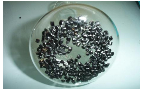
Figure 2. Nylon 66 clots on the flask( Product D )